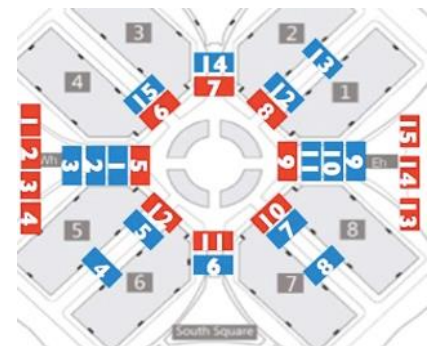
*West registration hall refers to red LEDs 1,2,3,4 All halls and passageways refer to all LEDs including red LED from 1 to15 and blue LED from 1 to15